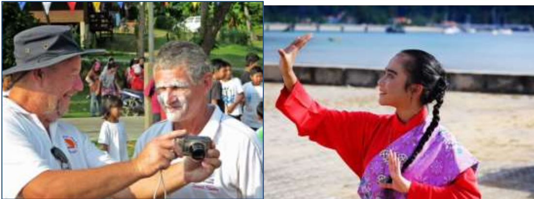
Sukan Rakyat in Tioman